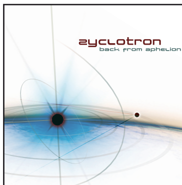
Back from Aphelion (2010) currently unreleased!